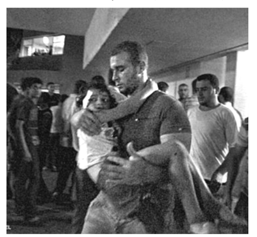
F-16 bombing in Gaza City, witnessed by an ISM volunteer from Manchester 30.7.10

Owns EDS Israel which provides the Israeli ministry of defense with an automated biometric access control system for Palestinian workers, in major checkpoints such as the Erez checkpoint (Gaza), Sha'ar Ephraim and Bethlehem checkpoints (West Bank).